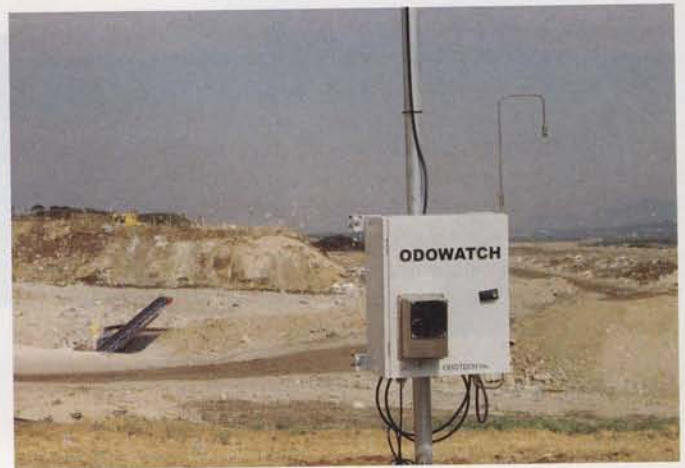
LEFT TO RIGHT Overview of the Ortec landfill and sludge composting site in Provence, France ■ An electronic nose in close up

The OdoWatch system implemented on the Ortec site consists of three e-noses, a meteorological station and a central control. A fourth e-nose had been planned, but was not implemented. E-nose #2 positioned at the lixivate recovery pool of the landfill, was designed to monitor the odour of fresh waste. E-nose #4 was positioned at the edge of the sludge composting area in order to monitor the odour of the composting windrows. E-nose #3 was located on a small hill between the landfill and the composting area. After calibration effected using the data collected on the site and analysed by dynamic dilution olfactometry according to European Standard EN 13725, the e-noses recognized and quantified in odour units (o.u./m 3 ) the odours emitted by the site.